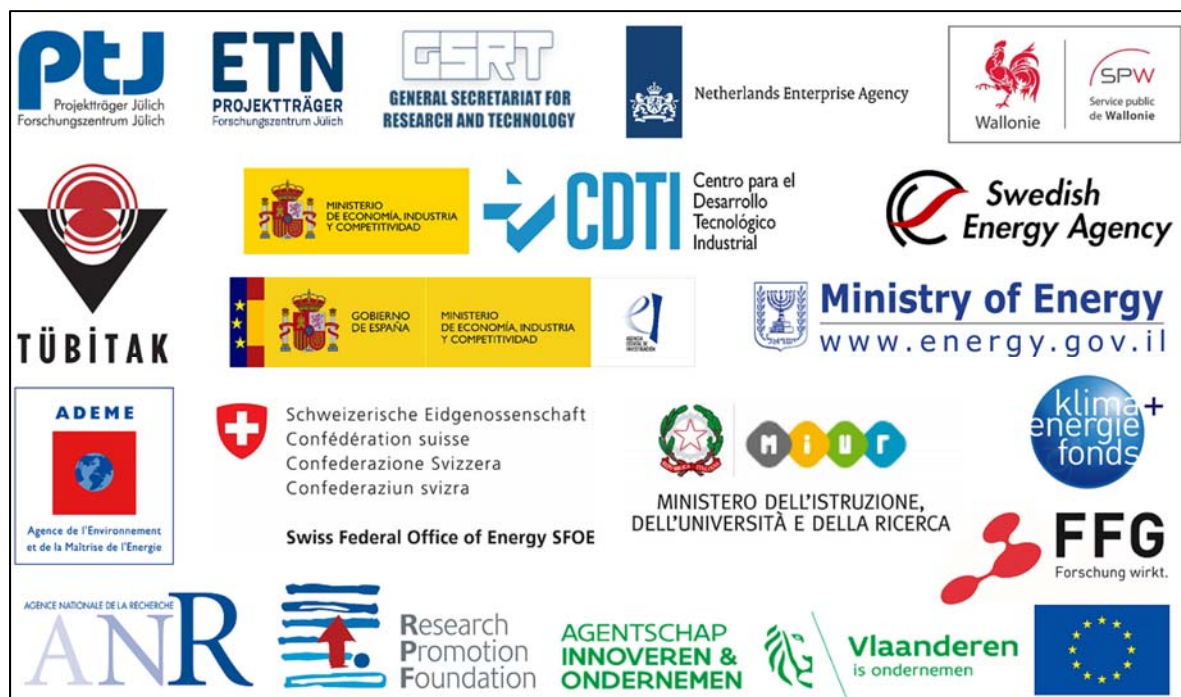
Figure 1: Organisations involved in promoting the SOLAR-ERA.NET Cofund 2 Joint Call and providing support and funding to innovative transnational projects.

The participating national SOLAR-ERA.NET partners / contact points are listed in Table 1. Each applicant have to check the project idea with the national contact point as early as possible in the preproposal phase, at the latest before submitting any applications.